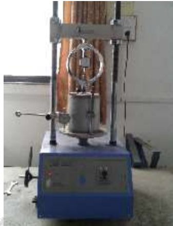
Fig -1: CBR Test Assembly